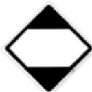
Limited Quantity Ground